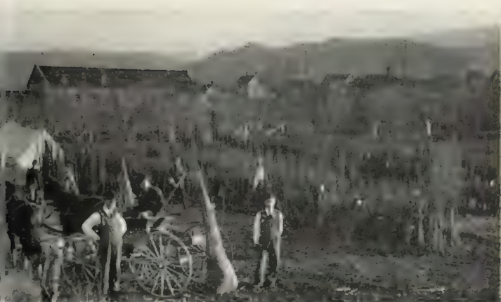
First Delivery of "C & O" Trees Nearly 50 Years Ago

An all red McIntosh—coloring about ten days earlier than McIntosh Red, having more color, more of the fruit is in the extra fancy grade. It can be picked earlier eliminating loss from windfalls, a serious objection with ordinary McIntosh Red. With ordinary McIntosh, many times they are on the ground before picking time.